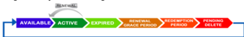
Figure 1: Domain name lifecycle

Domain name under .GH lifecycle is represented by figure1. The duration of each stage follows those of gTLD 1 represented at figure 2.