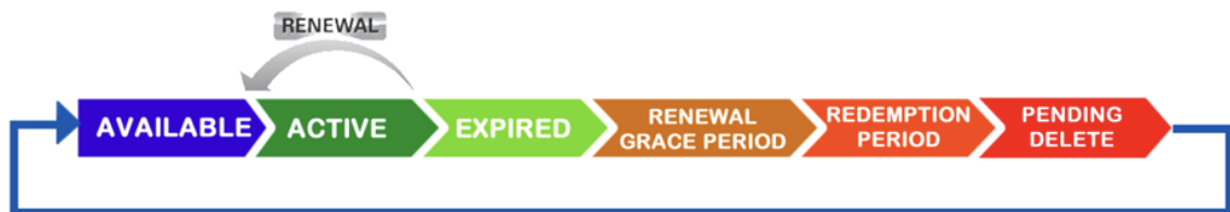
Figure 1: This Diagram is for Registrar/Registrant without administrative intervention

After the 14 days Pending Delete period, the domain name will be released by the Registry. At this point, the domain will be available to the general public for registration on "First come First served basis".